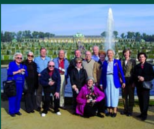
Elderhostel group in front of the Sanssouci castle in November 2006