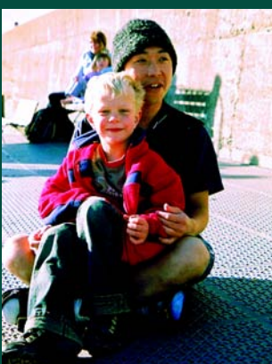
Demi-Pair participant in New Zealand