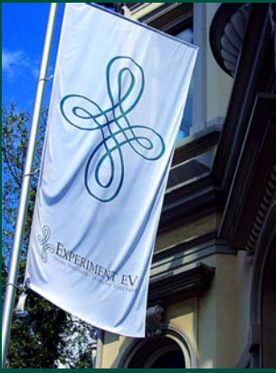
Our office in Bonn